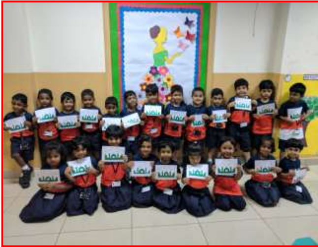
C&amp;I – Ramzan greeting card