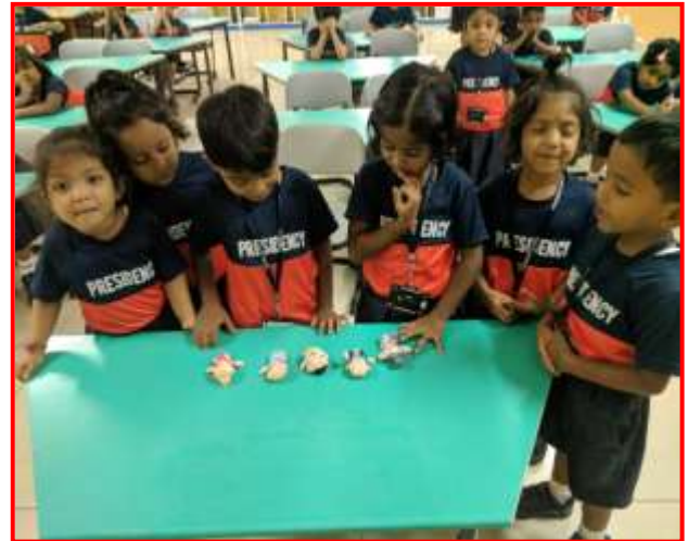
ES- Big family and Small Family