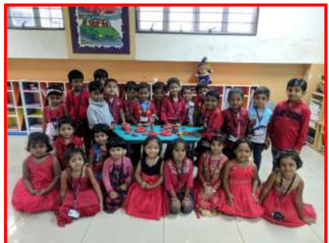
Red colour day