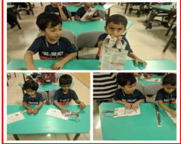
ES- Paper bag activity