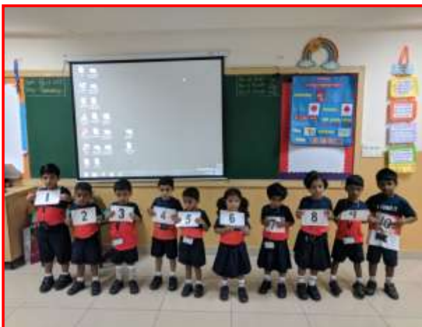
EL- numbers in order (1-10)