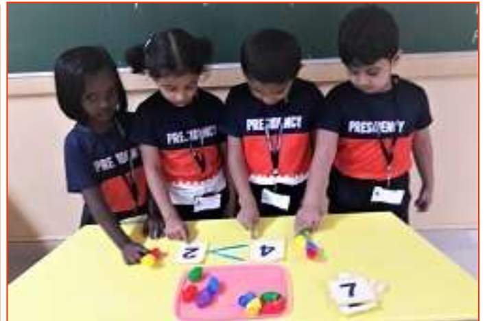
EN: Greater than, Lesser than, Equal to