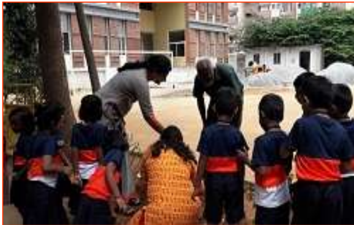
C&I: World Environment Day activity