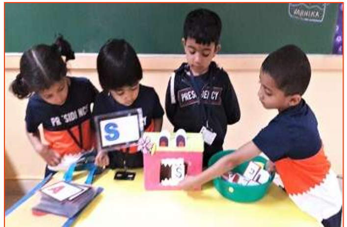
EL: Matching letters , monster activity