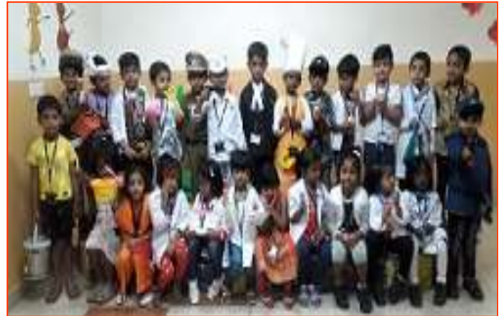
ES: Community Helpers