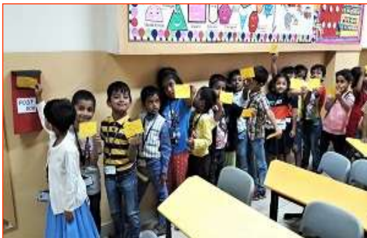
ES: Postbox activity