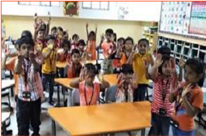
EN: Colour Orange