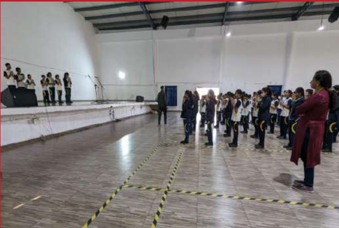
Developing a growth mind set