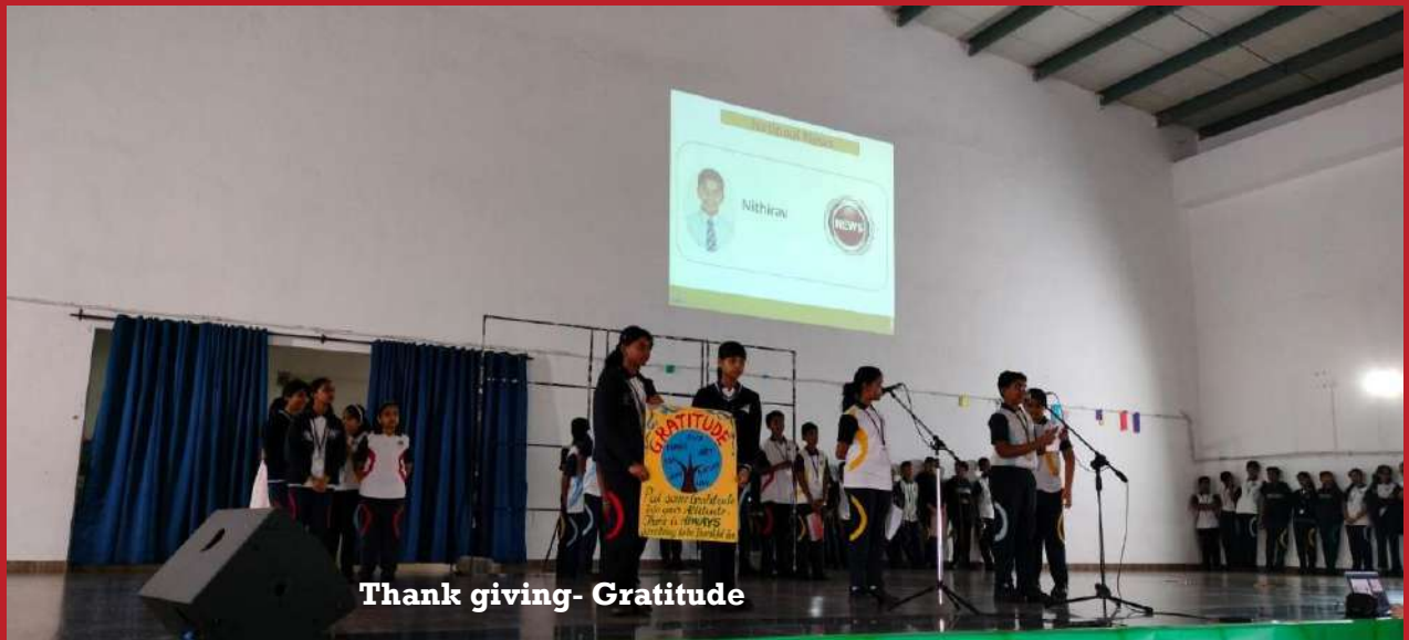
Thank giving- Gratitude