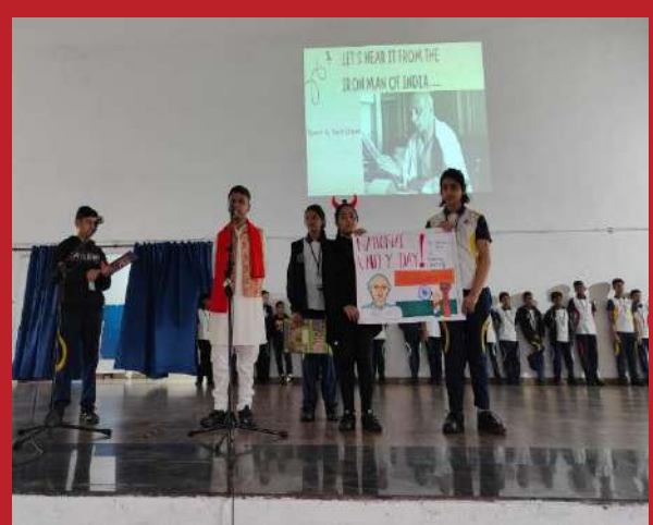
National Unity Day