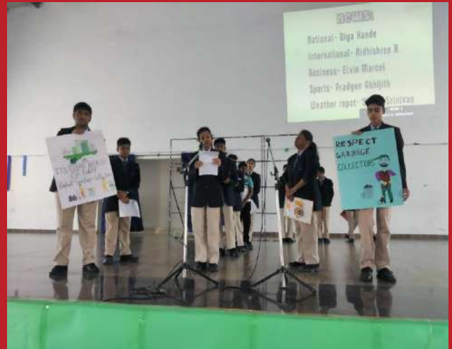
Salute to Garbage Collectors