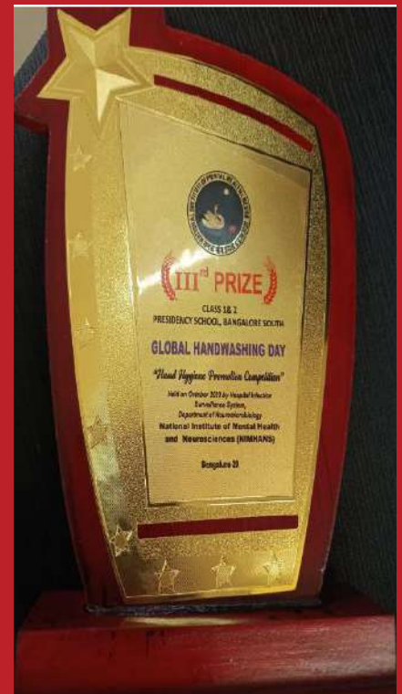
(Grade 1 & 2) received 3 rd prize in the Global Hand Washing Day competition by NIMHANS.