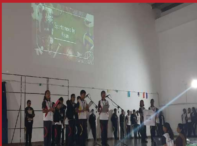
National Constitution Day