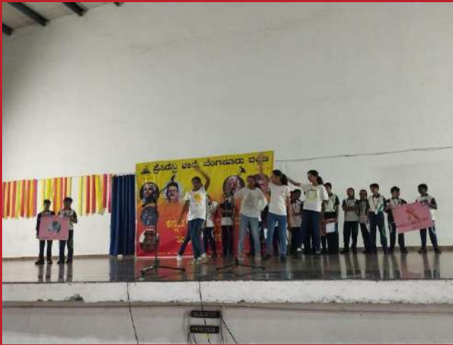
World Cancer Day