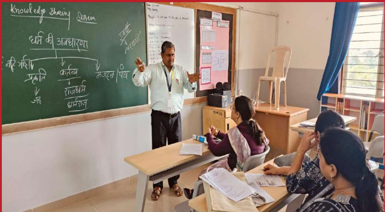
Knowledge Sharing workshop by Hindi Department